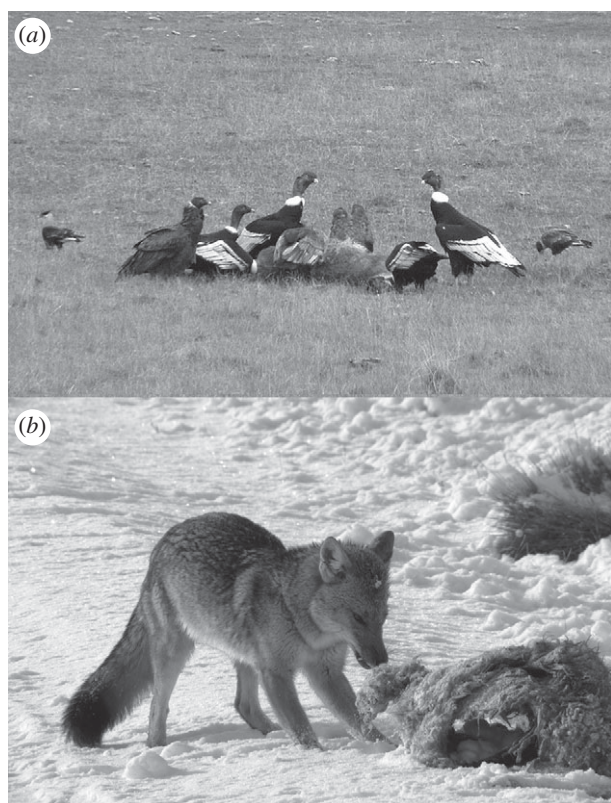
Figure 2. (a) Large Andean condors and a pair of smaller southern caracaras surround a guanaco ( Lama guanicoe ) killed by a female puma in Patagonia. (b) A culpeo fox scavenging from a guanaco carcass abandoned by a female puma.

wolves also defend their kills from competitors [21]. Solitary felids, by contrast, often retreat to cover to remain unobtrusive and minimize conflicts with other competitors [23], and thus are more susceptible to kleptoparasitism.